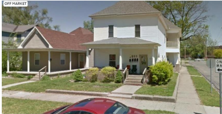
1701 N 9th St Terre Haute, IN 47804

renting a room at 1701 North 9th Street and is listed as a music teacher working at her own studio. This is the house as it stands today in that same address: