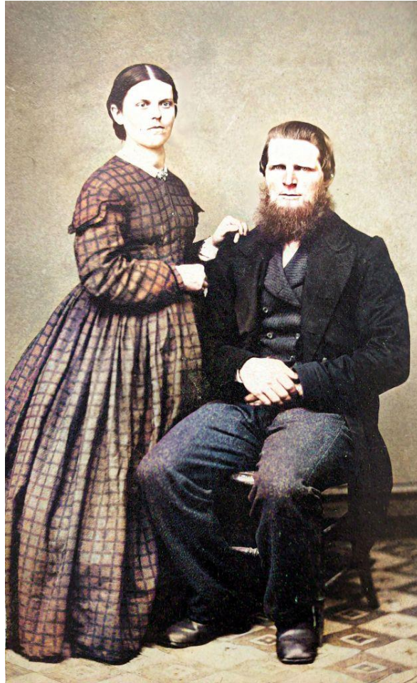
Photos Without Families, originally shared on www.photoswithoutfamilies.blog