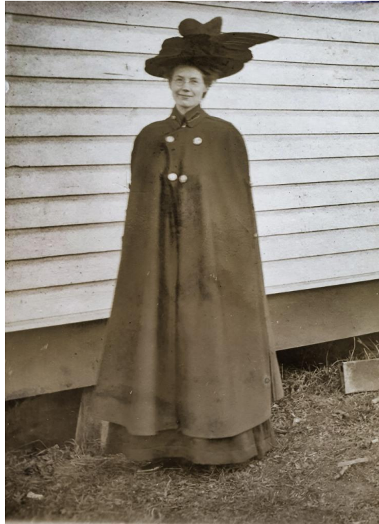
Photos Without Families, originally shared on www.photoswithoutfamilies.blog