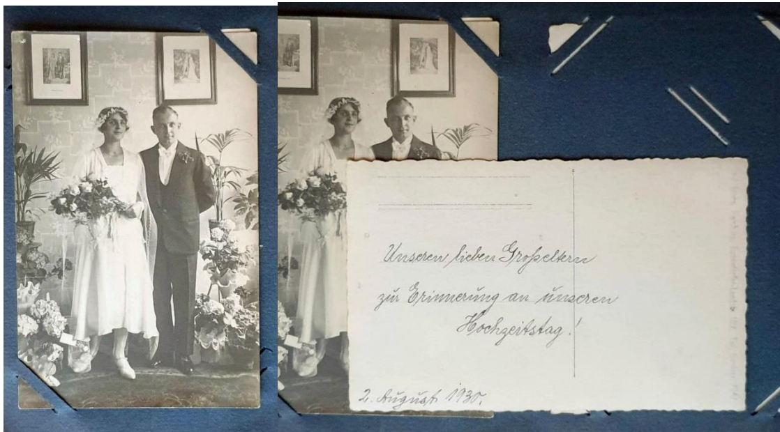
The next photo from 1940 is titled "The 10th anniversary of our business" and the only clue is the phonenummer on the window. But I did not know in which city or in which street this shop was located at. Luckily, my amazing Instagram community got busy doing detective work and found the second photo on sale on the internet! It's the same entrance, just a few years apart. And it gives us another clue – the house number was 28.